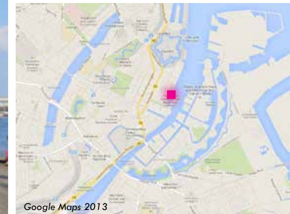
Google Maps 2013

The playhouse is rooted in the context of its historic neighborhood and is clad in copper; integrating the stage tower in the Copenhagen skyline of copper domes and spires.