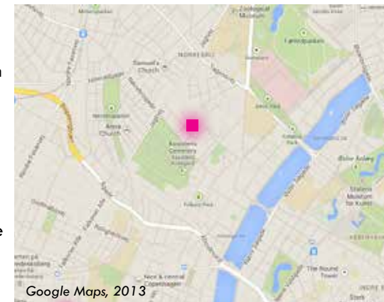
Google Maps, 2013 ■ SITE: Sjællandsgade 10, 2200 København

In addition to serving various needs, the project site provides creative recreational opportunities. The playground equipment uses innovative design techniques and encourages vertical, creative play: climbing, swinging, balancing, and hanging. This project informs our work in the University District in several ways. The multi-purpose character of the project and the equipment design is based on the needs of the local community and efficiently uses space in innovative ways. The project also effectively illustrates how the prioritization of bike and pedestrian safety can generate well-used, community space.