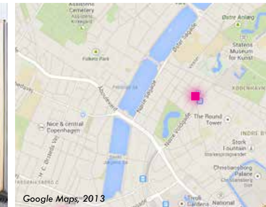
Google Maps, 2013