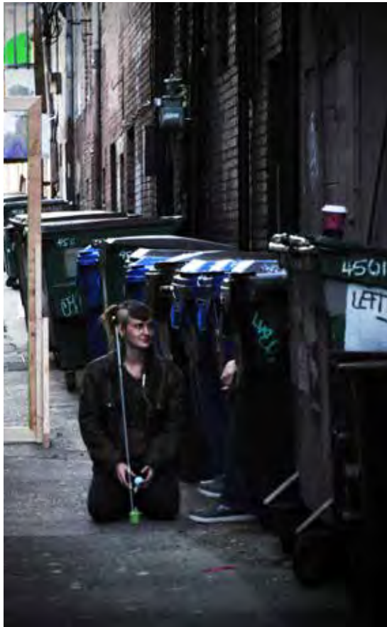
Playing, stopping, talking