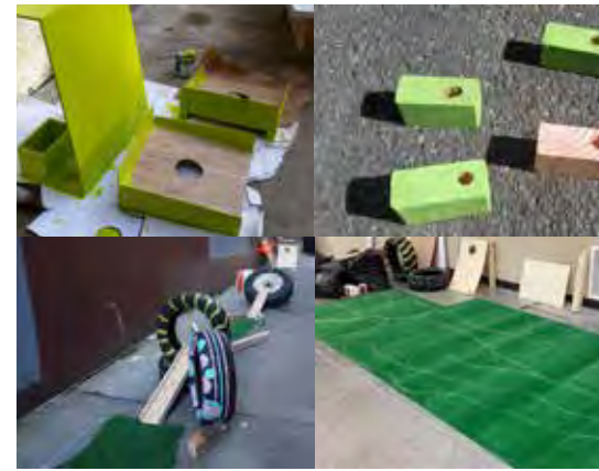
Cutting, painting, drilling, and setup