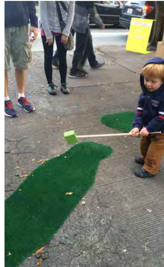
All ages enjoy Alley Mini Golf